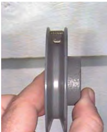
Figure 1. A worn fan belt riding low in the pulley reduces the effective pulley size. This belt should be replaced.

The top of the belt should ride slightly above the top of the fan pulley. A worn fan belt will drop down into the pulley so that the top of the belt cannot be seen in the pulley.