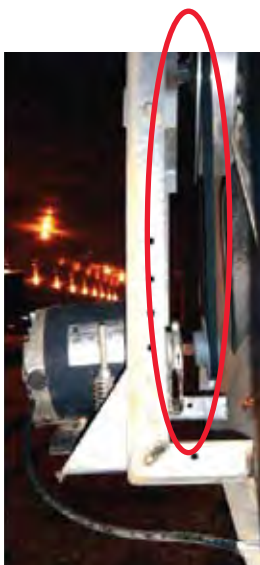
Figure 7. This fan motor and pulley are being pulled upward because of poor support on the fan frame.