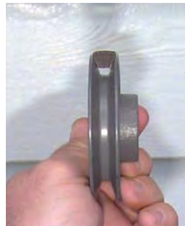
Figure 2. A new fan belt rides high in the pulley so that the top of the belt rides just above the top of the pulley.