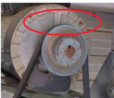
Figure 3. Front view of a new belt riding slightly above the pulley