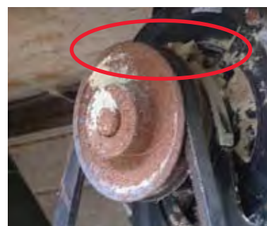
Figure 4. A front view of a worn belt riding low in the pulley