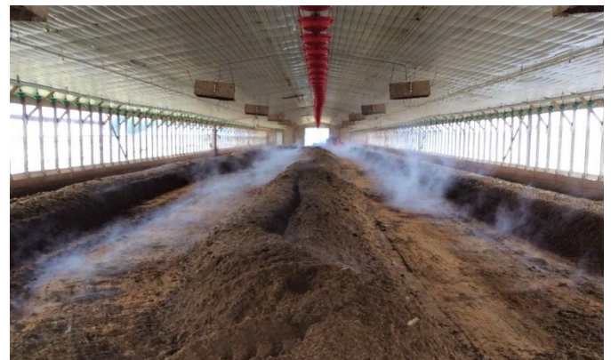
Figure 1 Windrow in a Turkey Barn