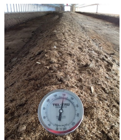
Figure 4 Checking Temperature with a Litter Thermometer